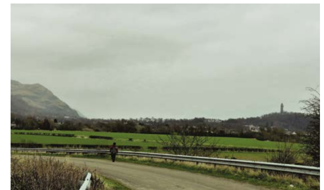
View of Wallace Monument

(If you want to visit the tidal limit of the River Forth, turn right at the bottom of the slope from the motorway bridge. Follow faint paths along a hedge line and ditch line, and then turn right along the fisherman's path for 400m to the rapids near Old Mills Farm. Retrace your steps to the minor road).