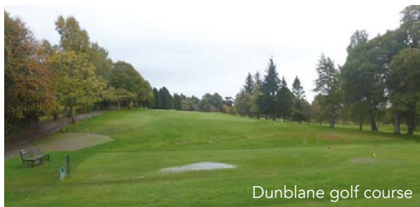
Dunblane golf course