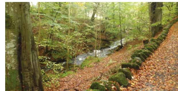
Track alongside Cock's Burn

5 Turn left, following the Darn Road as the Allan Water flows downstream on the right. After 50m cross Cock's Burn by a bridge and ford when it is in spate. Keep right and continue on the Dam Road track until reaching a street, Blairforkie Drive. Turn right downhill and upon reaching the main road at the bridge over the Allan Water, turn right and continue along this road to the Bridge of Allan Railway Station.