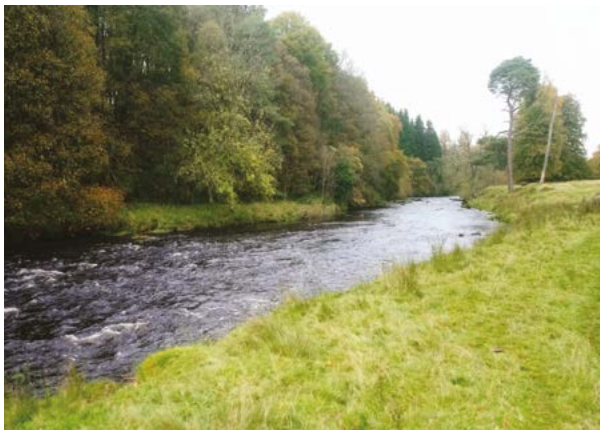
Allan Water near Kippenross House