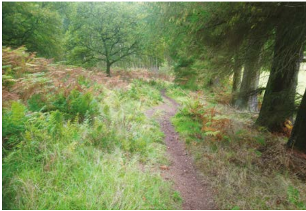
Path near Bridge of Allan