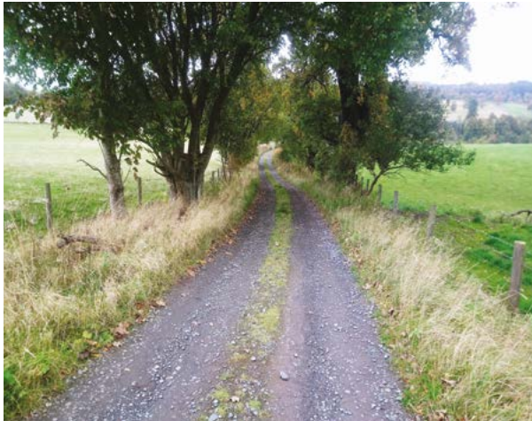
Track near Park of Keir