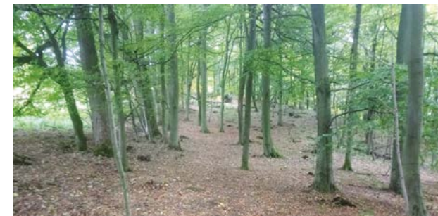
Path on Gallow Hill

2 The footpath climbs Gallow Hill. Keep left at the fork 200m further on. After crossing an old wall the path goes slightly right and gets fainter and generally keeps near the field to the right of the wood. The path comes out of the wood at a junction. Go straight ahead, downhill until the track takes a sharp right turn: at this point go through the field gate on the left and follow the track to reach the dual carriageway.